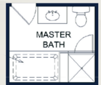
Master Bath Option 2